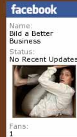
Bild a Better Business